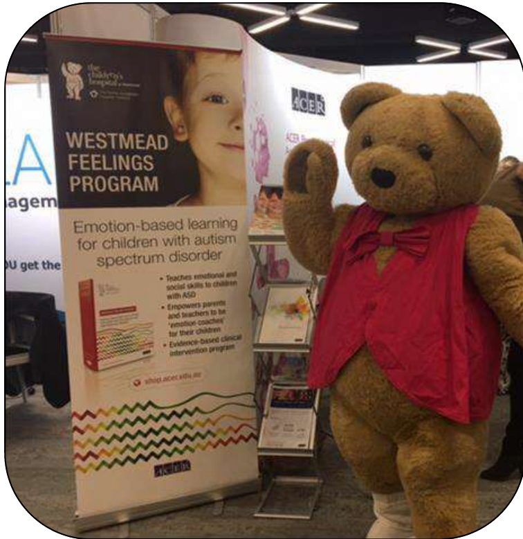
The Bandaged Bear celebrating the launch of Westmead Feelings Program 1 at APAC 17.

The Westmead Feelings Program 1 has been launched, making this evidence-based program for children with Autism available to every child with Autism worldwide. Westmead Feelings Program 1: emotion-based learning for children with autism spectrum disorder and mild intellectual disability (WFP 1) was launched at the Asia Pacific Autism Conference 2017 (apac 17) held in September in Sydney. WFP 1 is a therapy program delivered by educators and allied health professionals that promotes emotions competence skills for children with autism and develops parent and teacher emotion coaching skills. WFP 1 was formerly known as Emotion-based Social Skills Training for Children with Autism (EBSST). Based on ten years of research and development, WFP is an evidence-based program that has been shown to improve children's emotions competence in treatment versus control trials of over 330 children on the autism spectrum, with and without intellectual disability (Ratcliffe, Wong, Dossetor & Hayes, 2014; Ratcliffe, Wong, Dossetor & Hayes, under review).